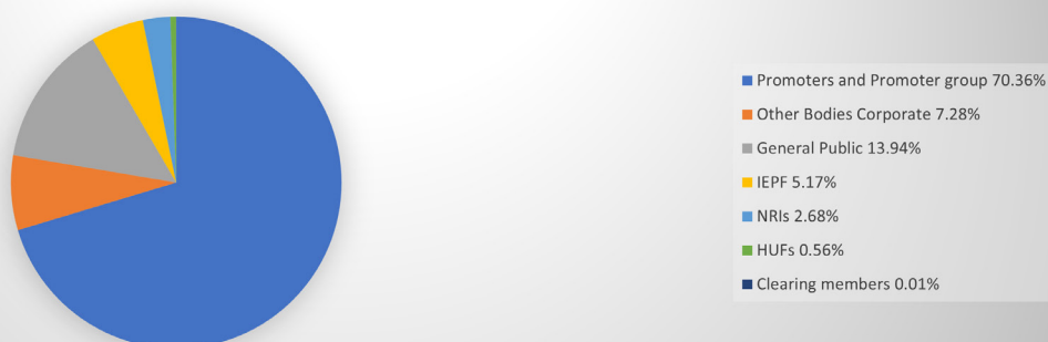
Percentage of shareholding pattern